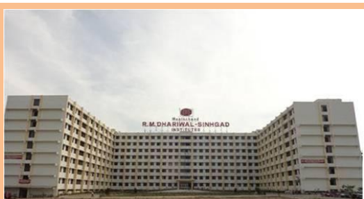
RMD Sinhgad School of Management Studies Campus, Warje, Pune

SET your Goals! Research Paper Presentation & Publication